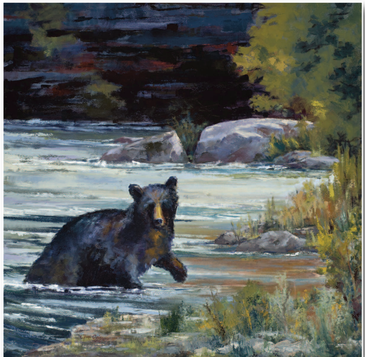
WILDERNESS GUEST | 30" X 30" | OIL