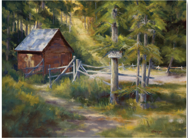
TRAVELERS' REST | 18" X 24" | OIL