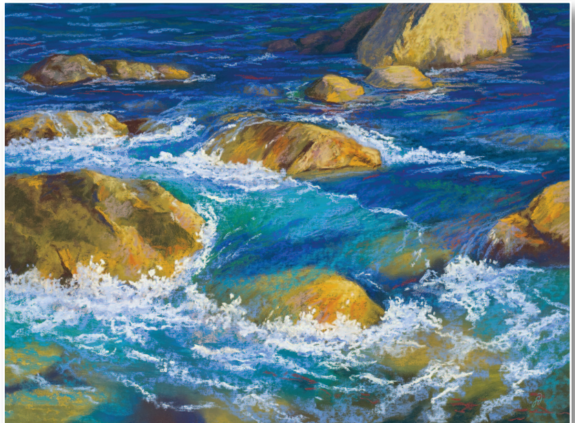
ROCK 'N' FLOW 3 | 18" X 24" | PASTEL