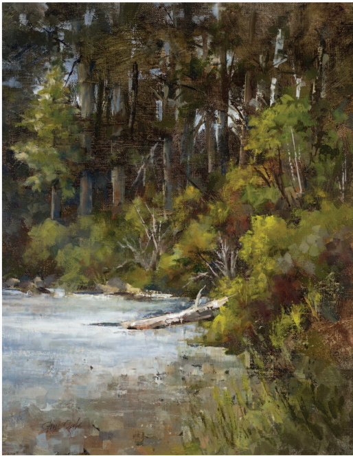
RIVER BEND | 14" X 11" | OIL